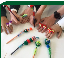
Art classes with Rang 6