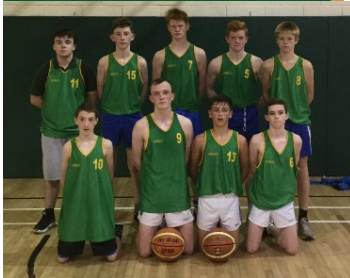
Cispheil faoi 16