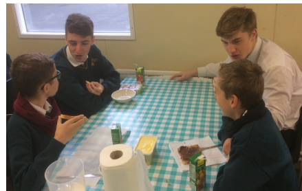
Scoláirí Bliain 6, 5 agus 1 ag baint taitneamh as an bricfeasta

and those who have been here for 5 or 6 years. It is also a very important part of the Pastoral Care programme in the school as it allows friendships to be formed that will endure during the academic year. It also provides the 1st year students with a chance to get to know their buddy and the other senior students in the school. €200 was raised for Childline from the breakfast.