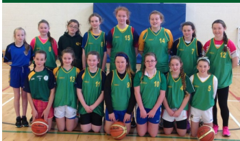
Cailíní Bliain 1