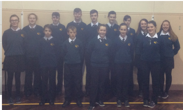
Comhairle na Mic Léinn 2016/2017

The Ceannairí are two 6th year students who are chosen by interview to be the representatives of the school on important occasions.