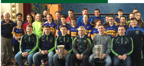
Grúpa múinteoirí, scoláirí agus Corn Liam Mac Cárthaigh agus Corn an Irish Press leis na himreoirí Thiobraid Árann